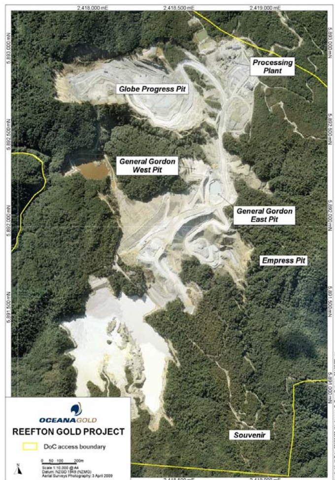
Figure 1: Reefton Gold Project

Figure 1 below provides an aerial view of the location of these deposits in relation to the processing plant (top right corner of Figure 1). Souvenir, which is the furthest south of the three deposits, is less than three kilometres from the processing plant for the Reefton mine and within the current mining permit.